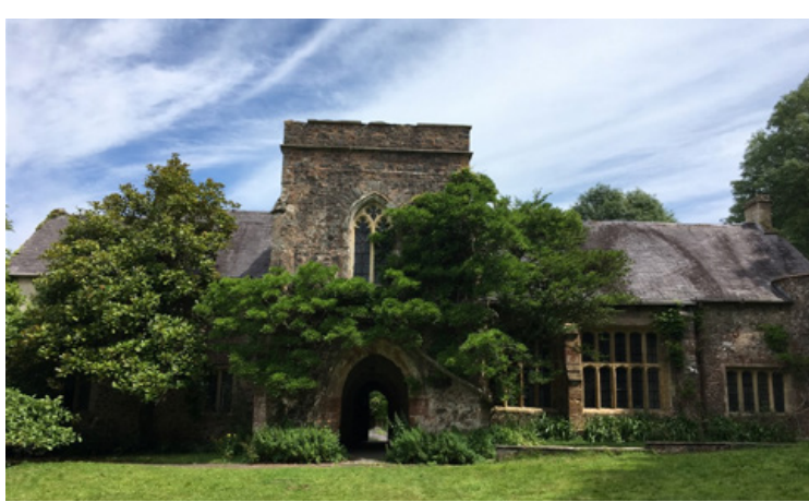
projects / conservation