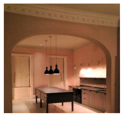
Reinstatement of the arch